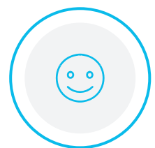
Quality of staff